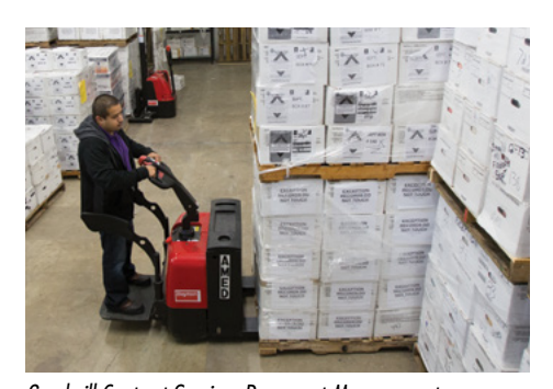
Goodwill Contract Services Document Management

Goodwill San Antonio's Good Careers Centers are a free community resource providing résumé and job search assistance to help individuals obtain jobs and build careers. All Good Careers Centers offer computer technology allowing community members to access databases of available positions throughout the region. More importantly, through our centers, Goodwill is able to serve and provide wrap-around supports to the often underserved members of our community – Individuals who are