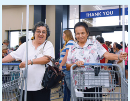
Kerrville Grand Opening — July 23, 2015