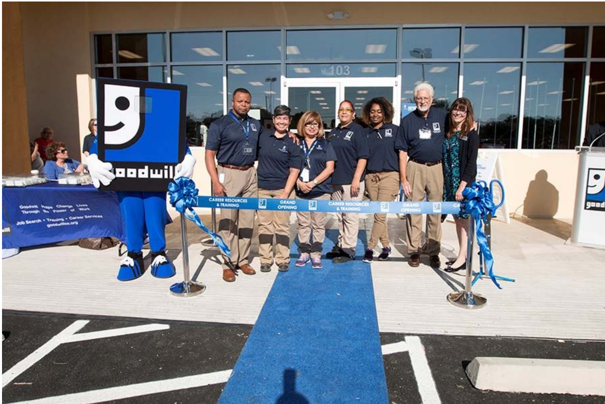
W.W. White Store and Donation Station team members.